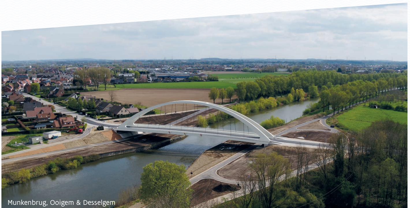
Munkenbrug, Ooigem & Desselgem